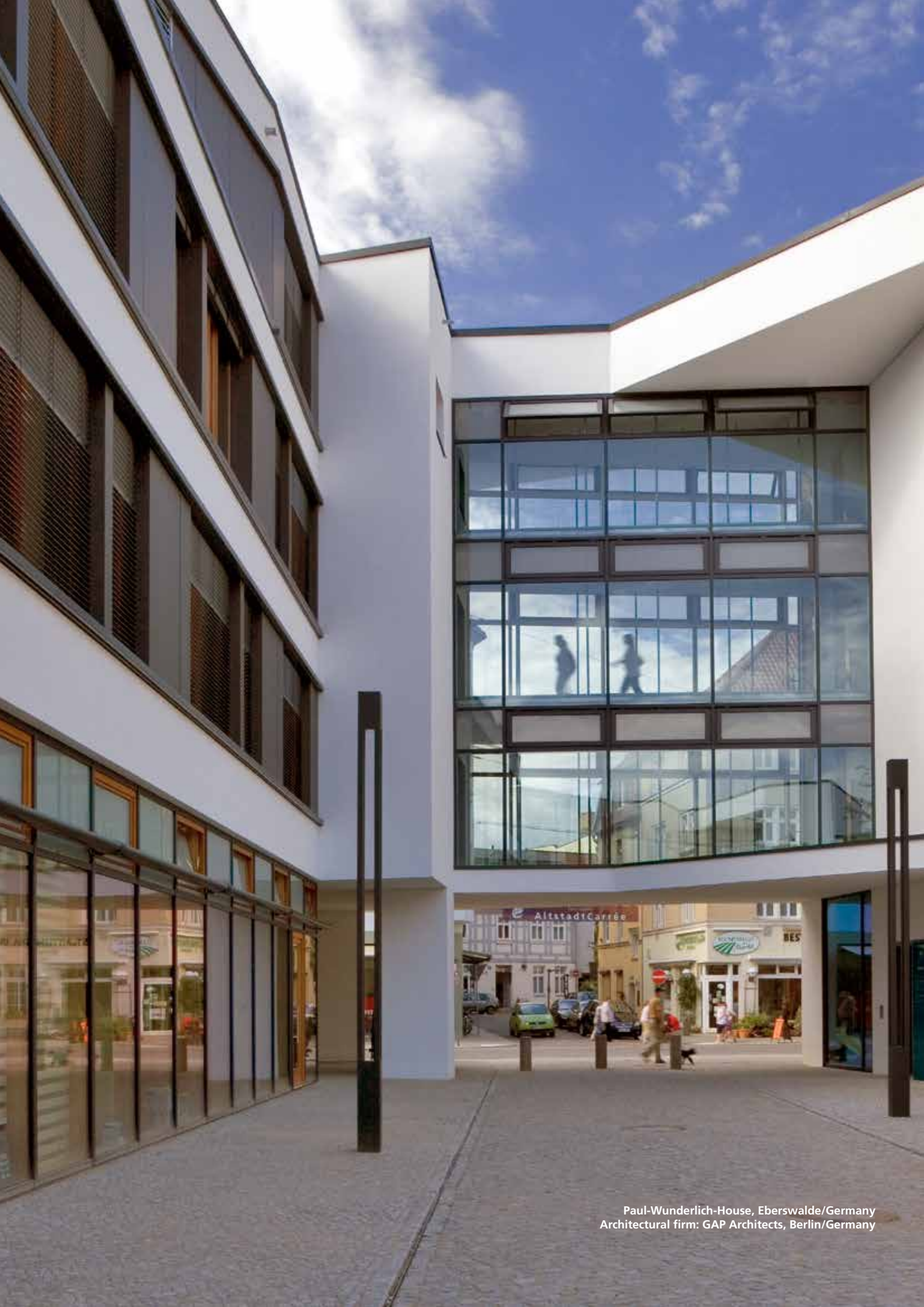
Paul-Wunderlich-House, Eberswalde/Germany Architectural firm: GAP Architects, Berlin/Germany