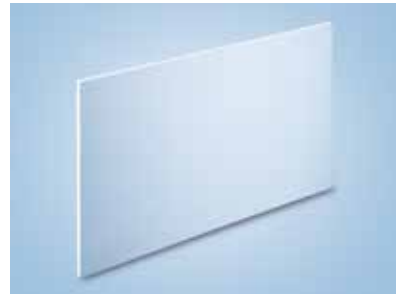
The render carrier board in recycled glass incorporates outstanding material properties which have secured it an outstanding track record worldwide.