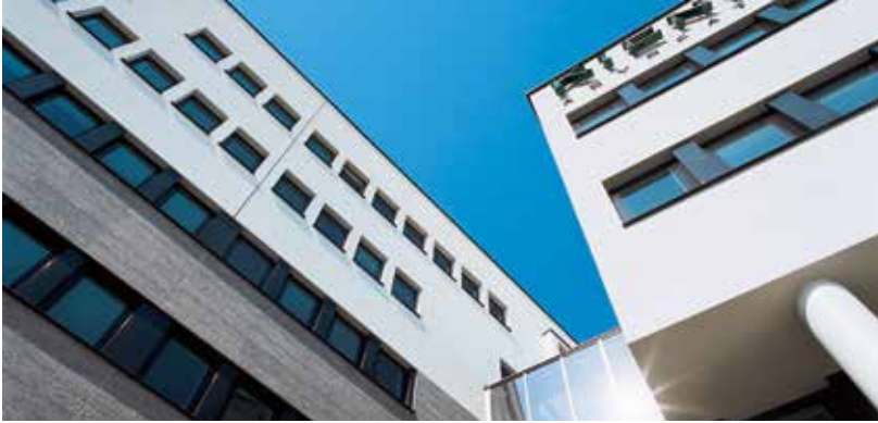
Office building Drienerbeek, Enschede/Netherlands Architectural firm: I/AA Architects & Engineers, Enschede/Netherlands StoVentec with natural stone