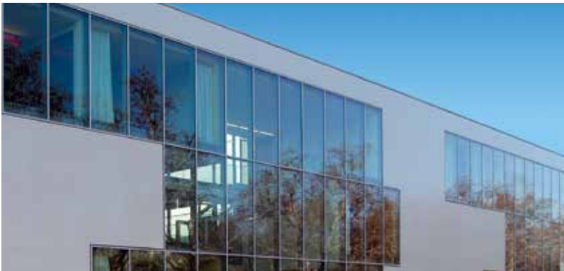
GEWOGE, Ludwigshafen/Germany Architectural firm: Allmann Sattler Wappner, Munich/Germany StoVentec with ceramics