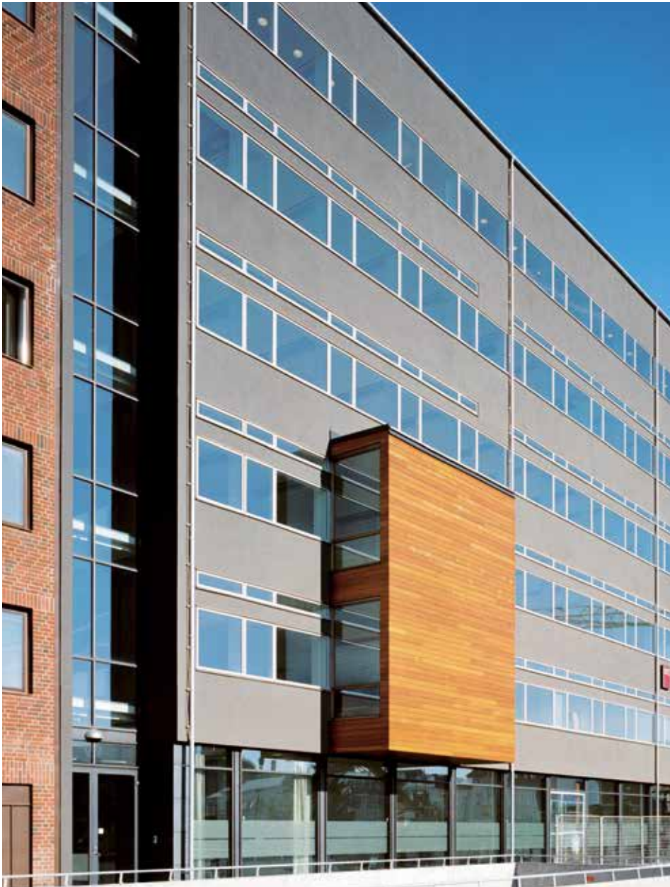
Multiple dwelling Scylla 2, Malmö/Sweden Architectural firm: White arkitekter AB, Malmö/Sweden

At a glance: One system – a host of advantages.